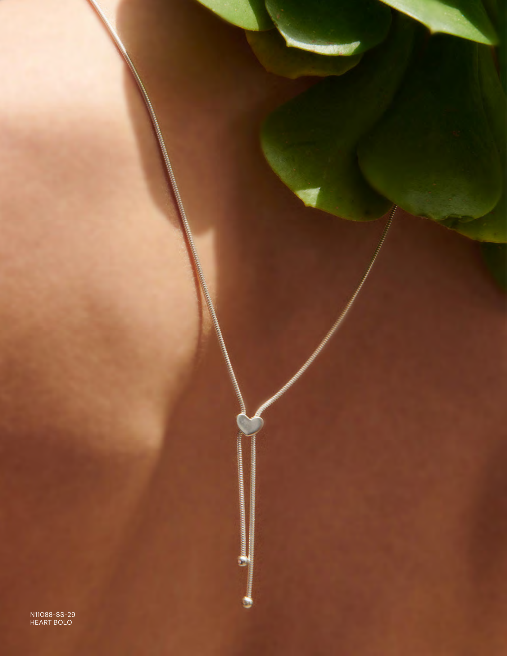
N11088-SS-29 HEART BOLO