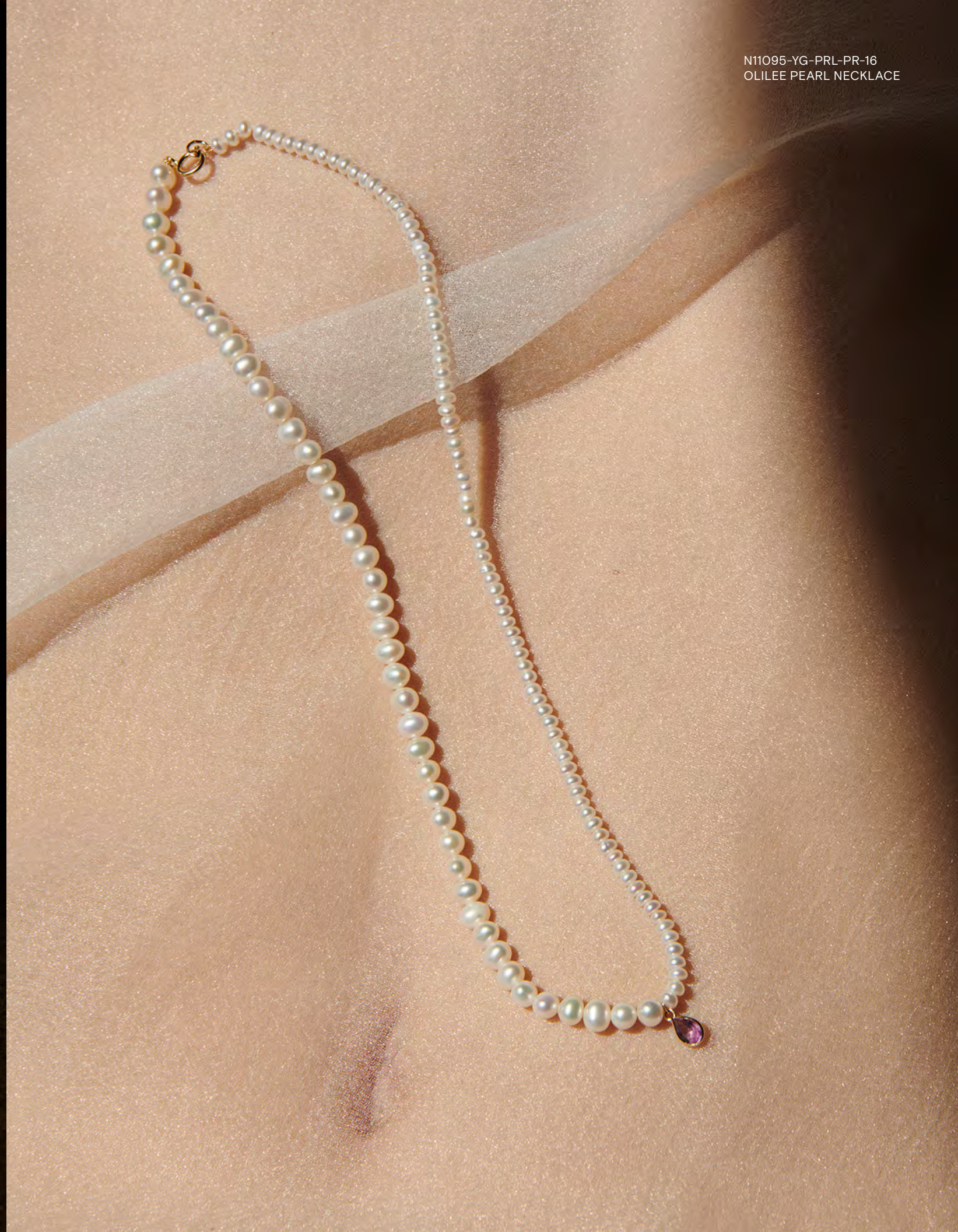
N11095-YG-PRL-PR-16 OLILEE PEARL NECKLACE