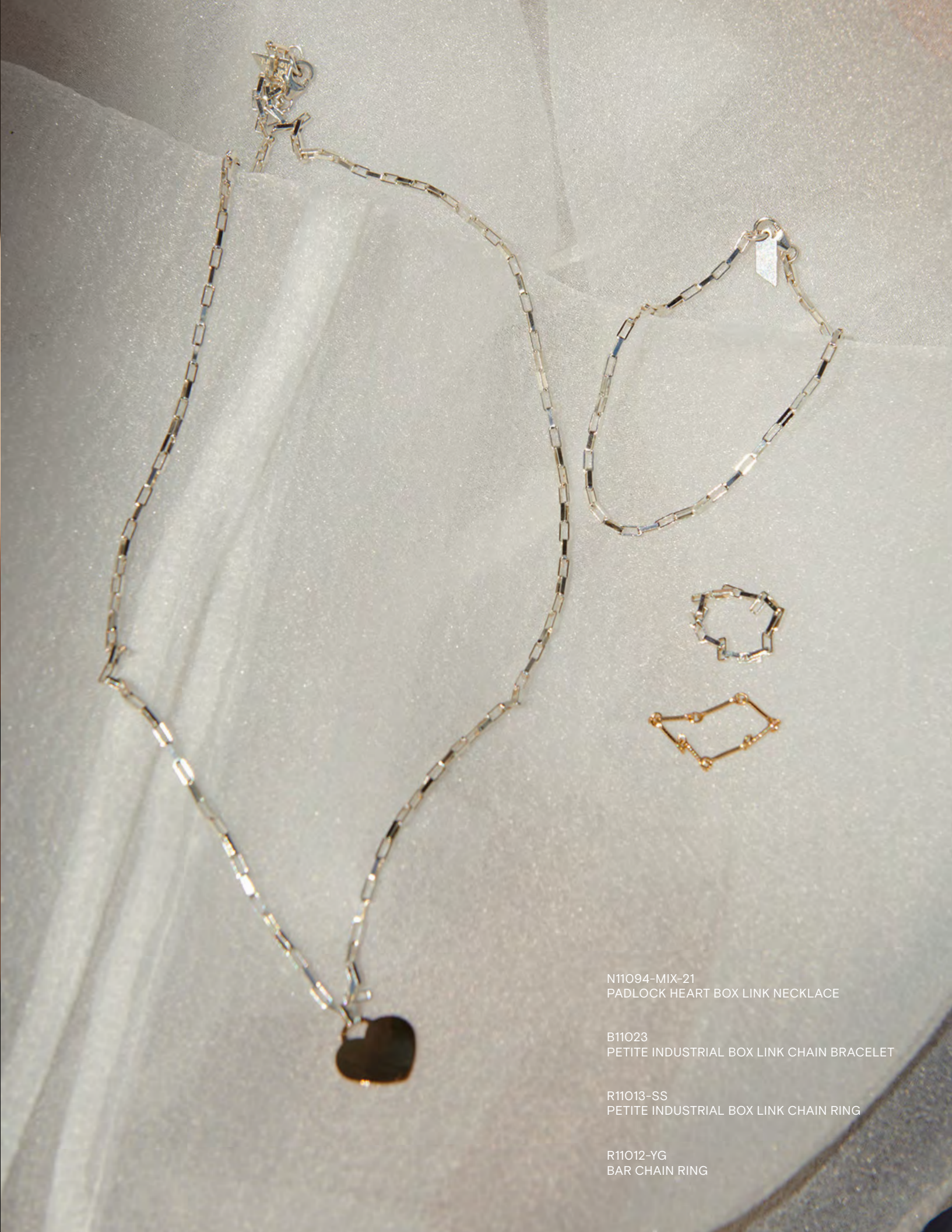
N11094-MIX-21 PADLOCK HEART BOX LINK NECKLACE