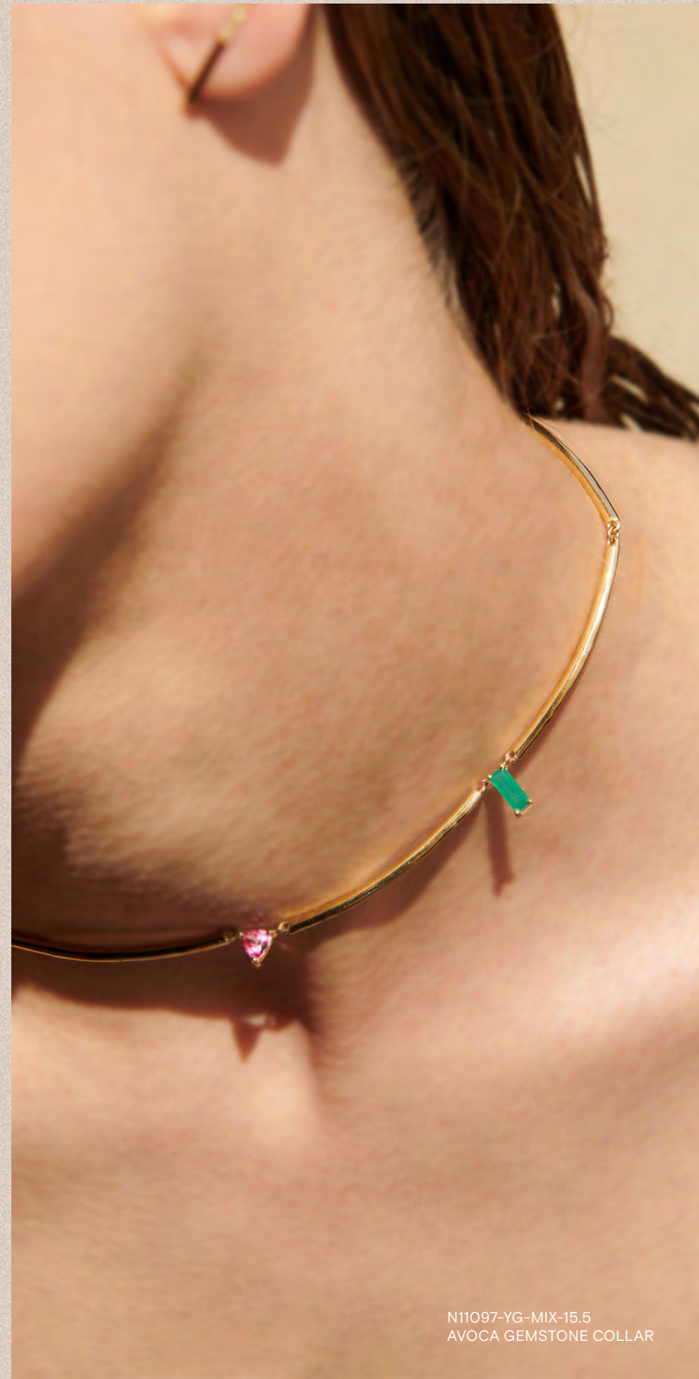
N11097-YG-MIX-15.5 AVOCA GEMSTONE COLLAR