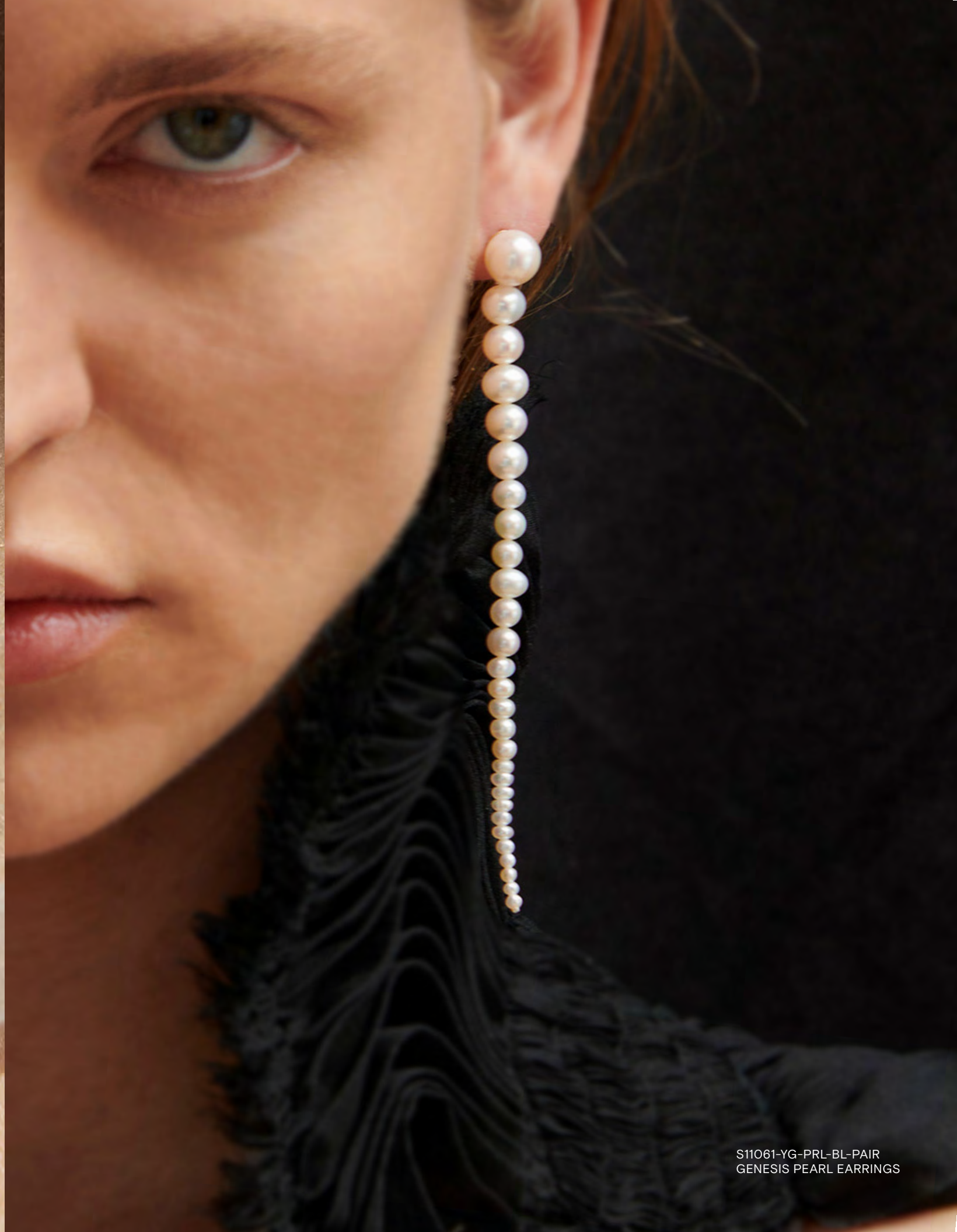
S11061-YG-PRL-BL-PAIR GENESIS PEARL EARRINGS