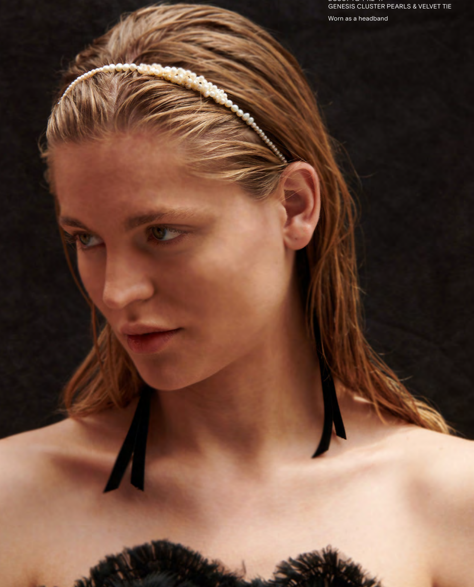
BC001-YG-PRL-41 GENESIS CLUSTER PEARLS & VELVET TIE Worn as a headband