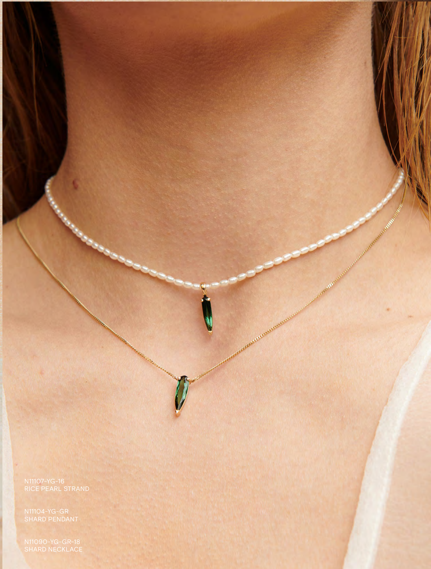
N11107-YG-16 RICE PEARL STRAND