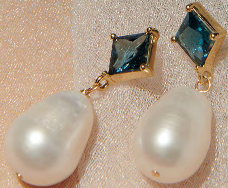
S11064-YG-PRL-BL-PAIR GEM BAROQUE LINK EARRINGS