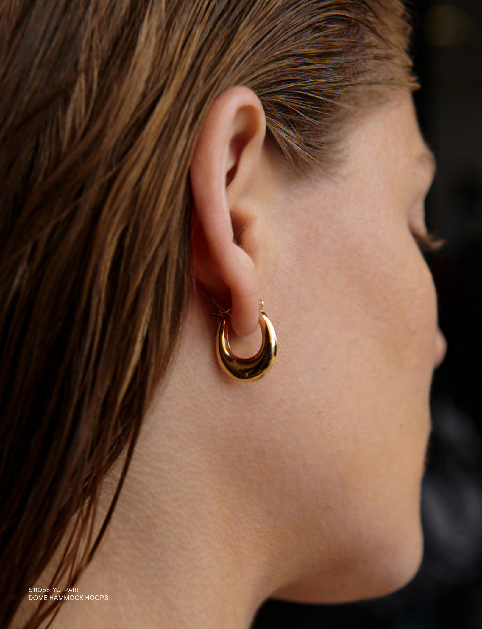
S11058-YG-PAIR DOME HAMMOCK HOOPS