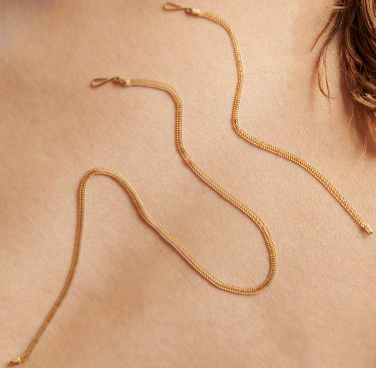
N11099-YG-16 MESH CHAIN NECKLACE