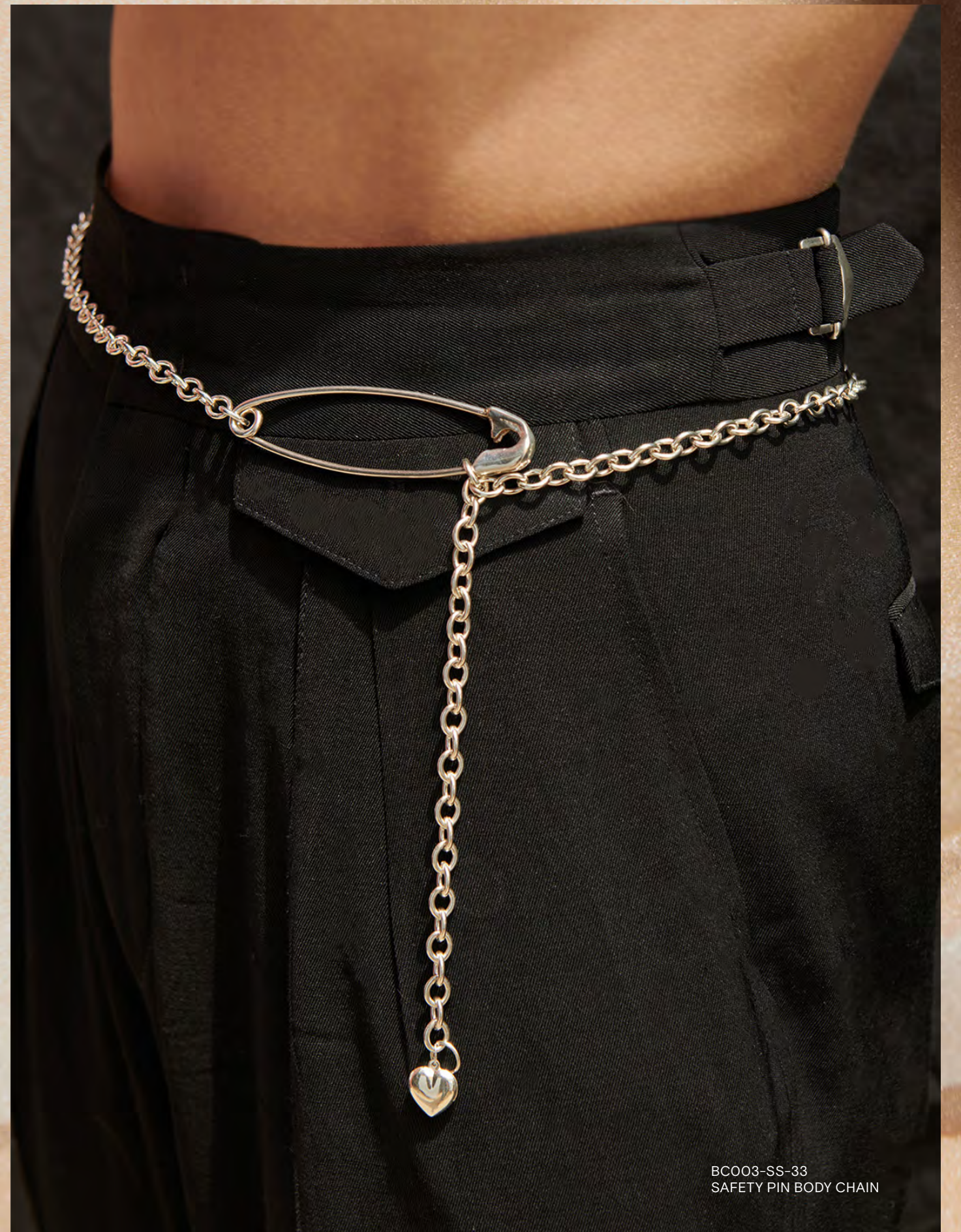
BC003-SS-33 SAFETY PIN BODY CHAIN