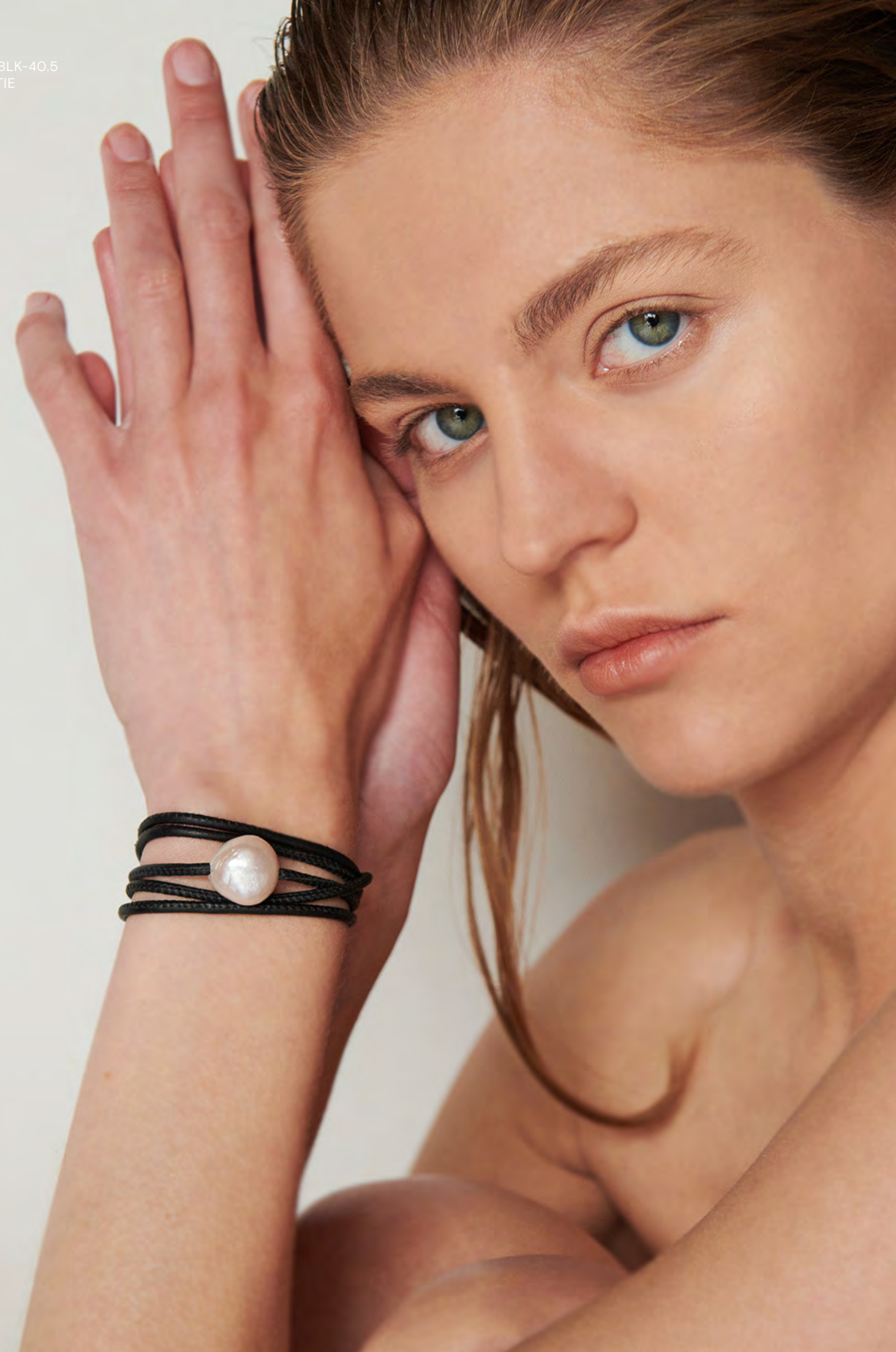
N11100-PRL-BLK-40.5 UNO PEARL TIE