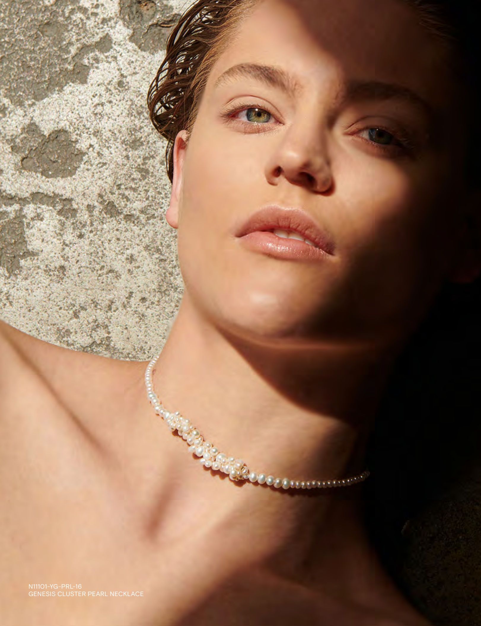
N1101-YG-PRL-16 GENESIS CLUSTER PEARL NECKLACE