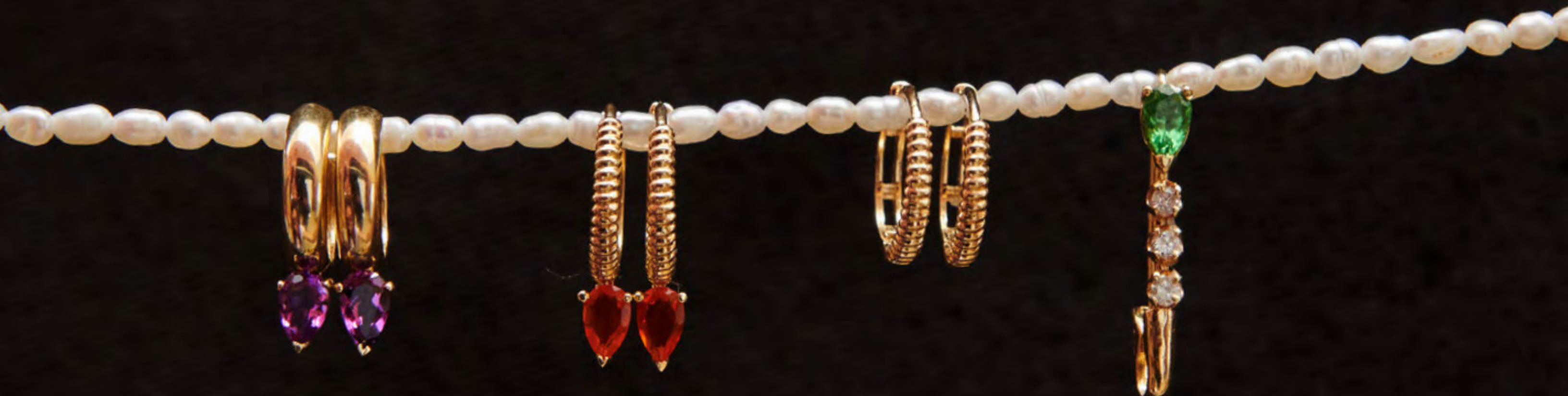
N1107-YG-16 RICE PEARL STRAND