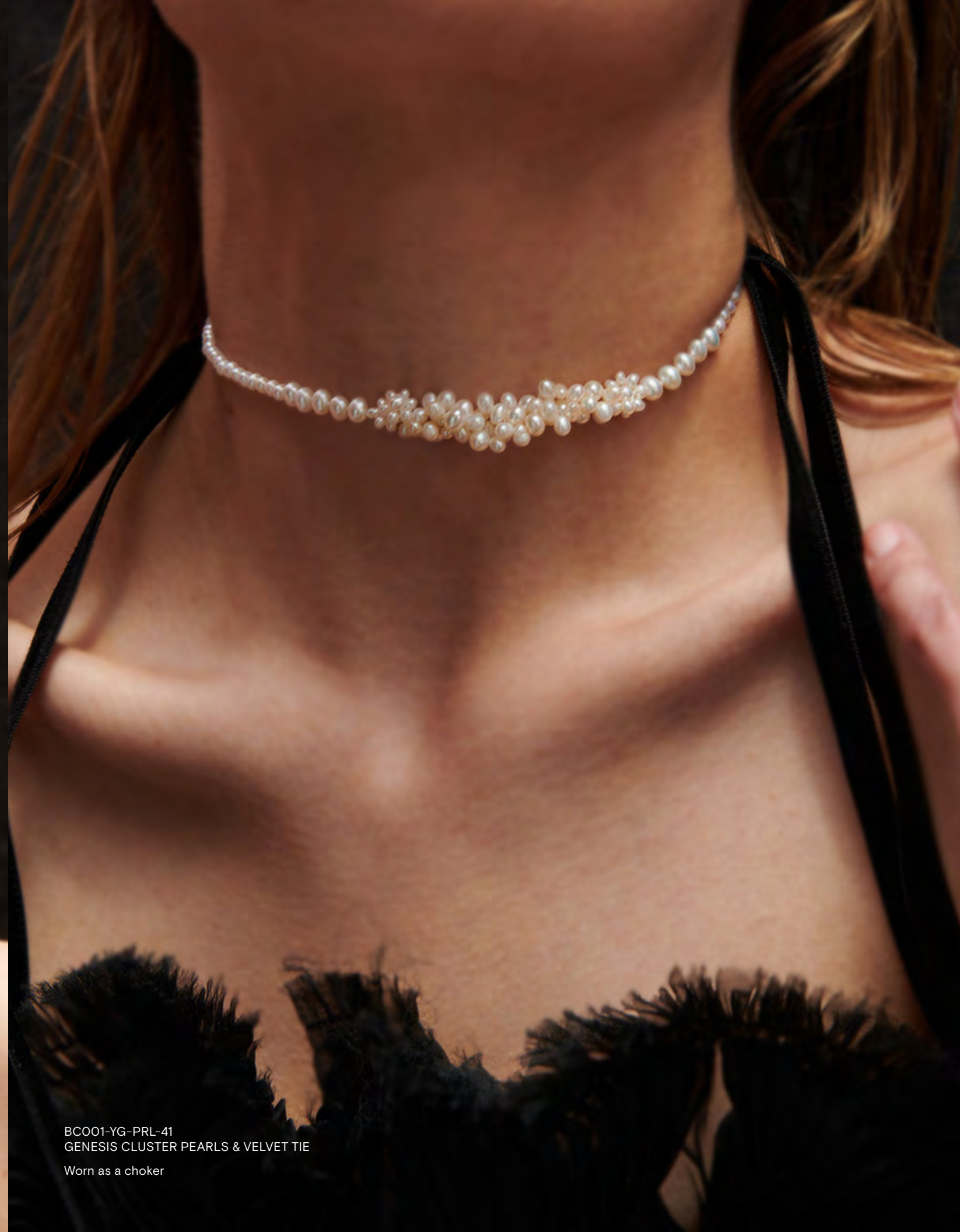
BC001-YG-PRL-41 GENESIS CLUSTER PEARLS & VELVET TIE Worn as a choker