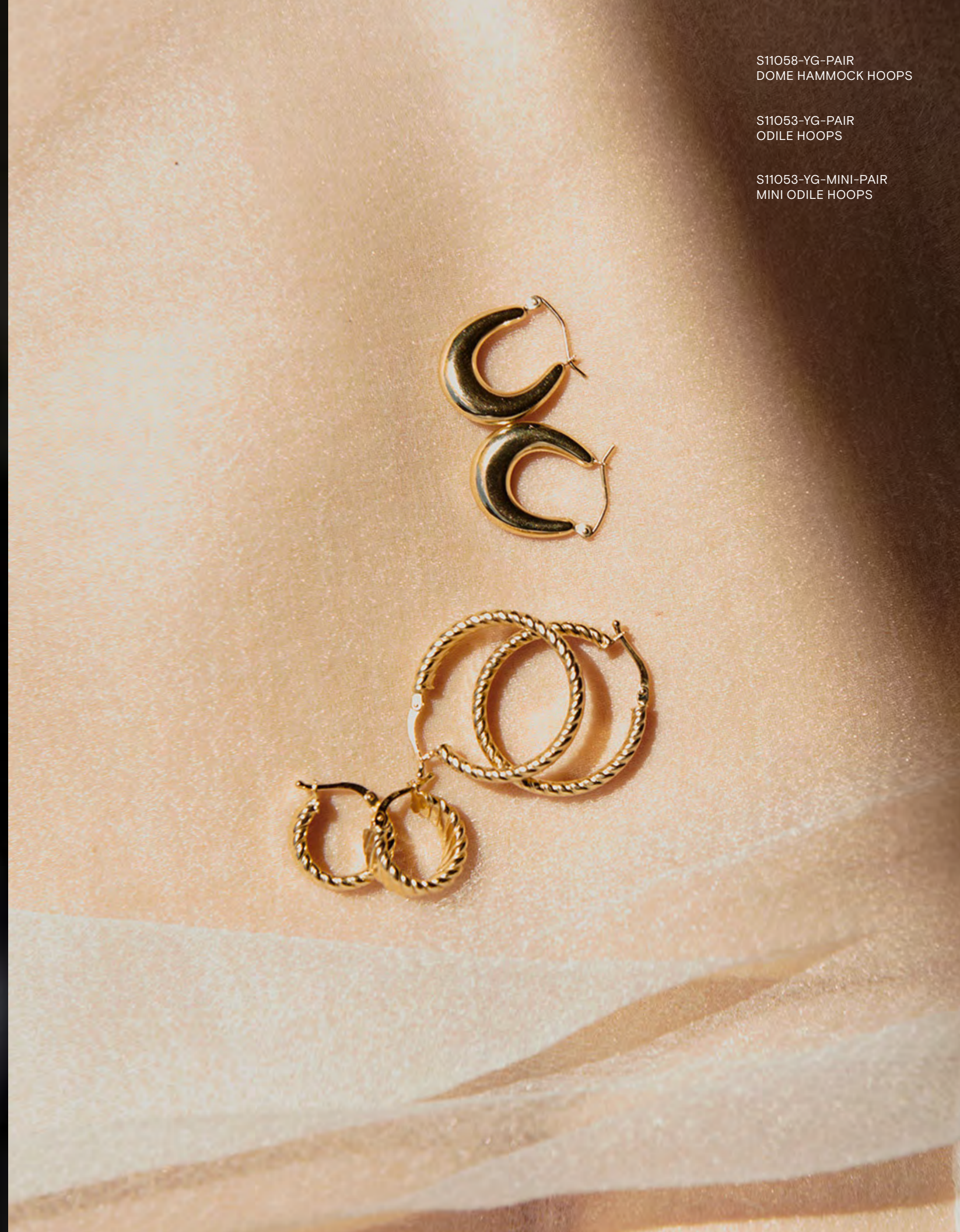
S11058-YG-PAIR DOME HAMMOCK HOOPS