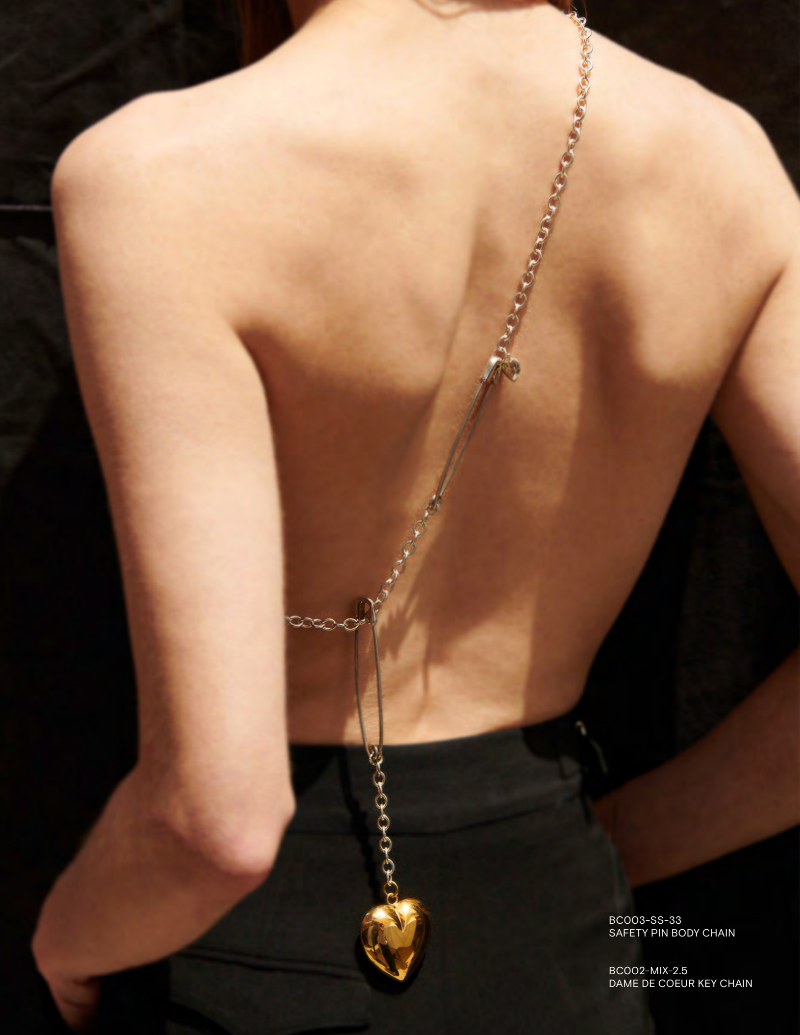
BC003-SS-33 SAFETY PIN BODY CHAIN