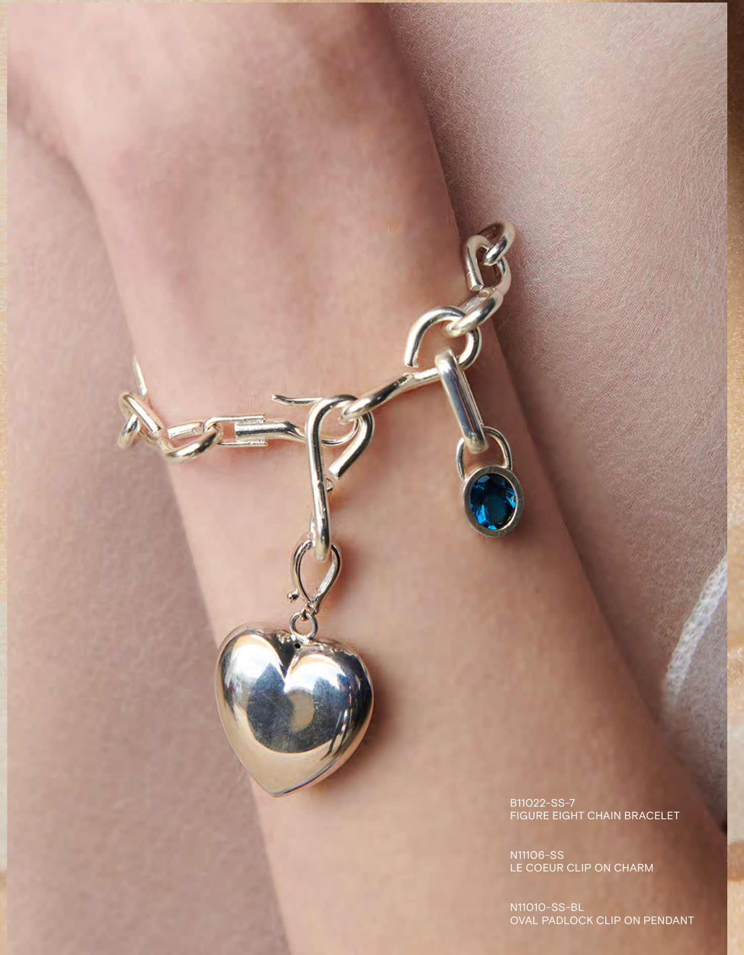
B11022-SS-7 FIGURE EIGHT CHAIN BRACELET