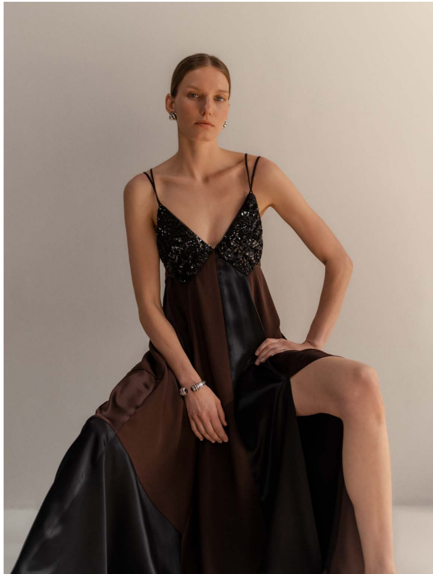
LOOK 14 Magdalena Dress in Black and Chocolate