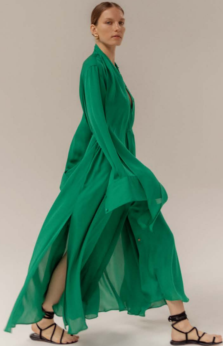
LOOK 9 Joanna Dress