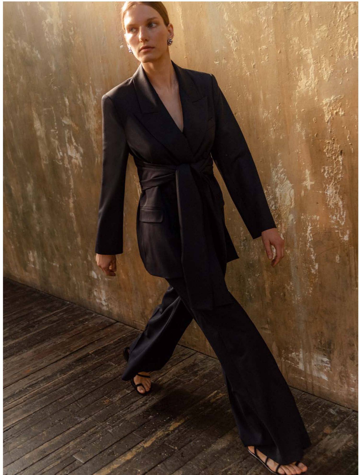
LOOK 8 Ines Blazer + Ines Trouser