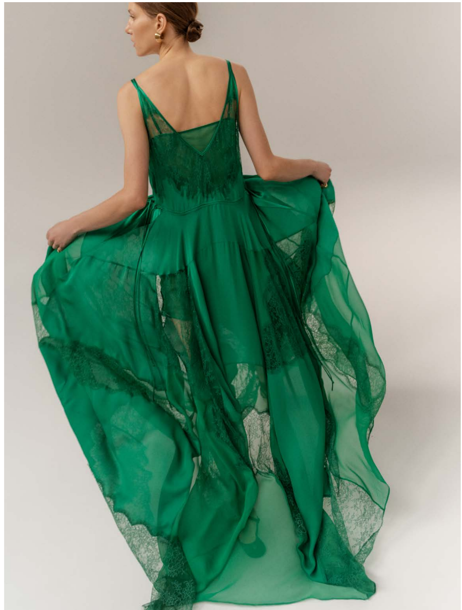
LOOK 10 Josephine Dress