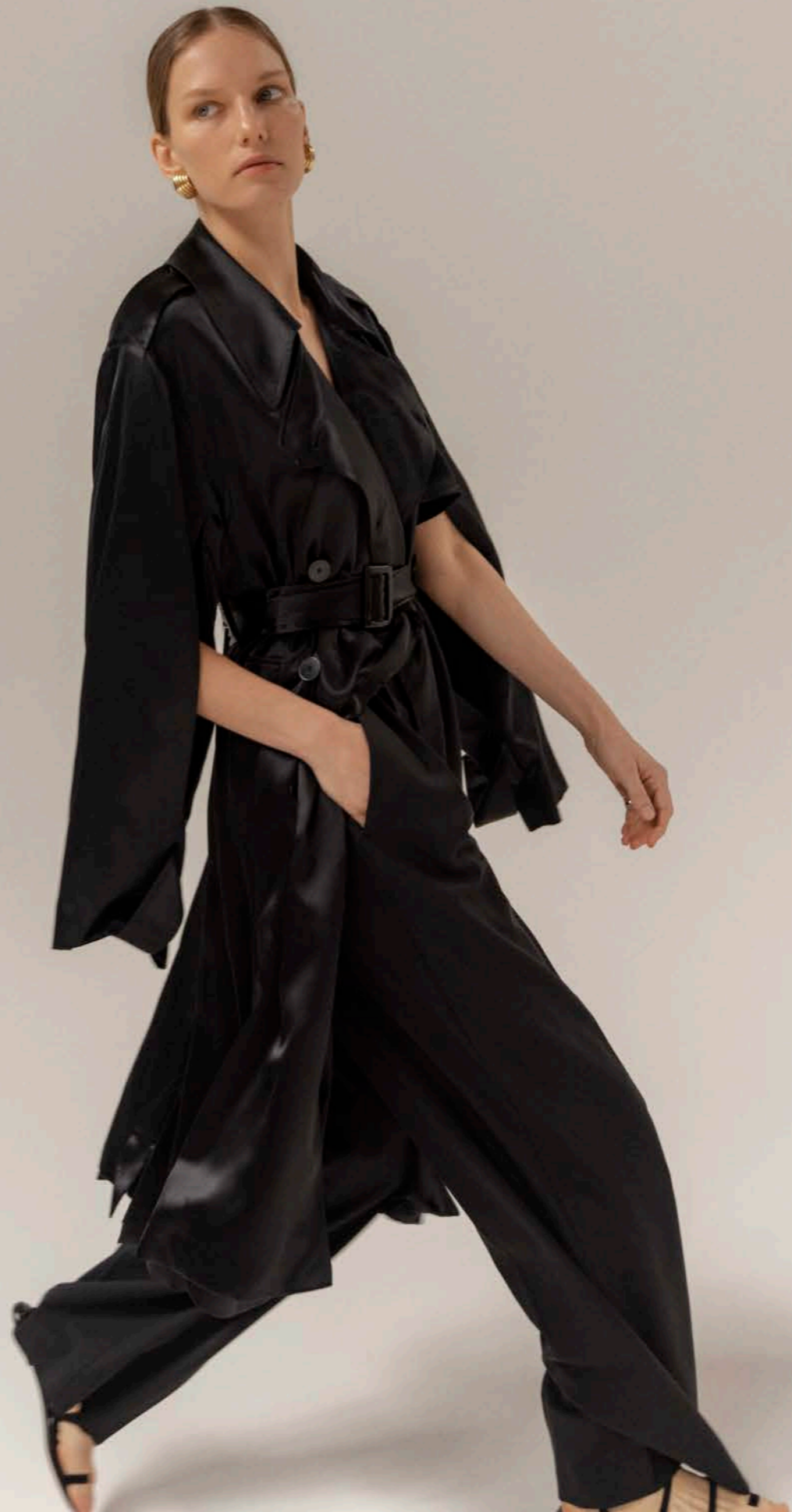
LOOK 13 Lourdes Silk Trench + Jack Trousers