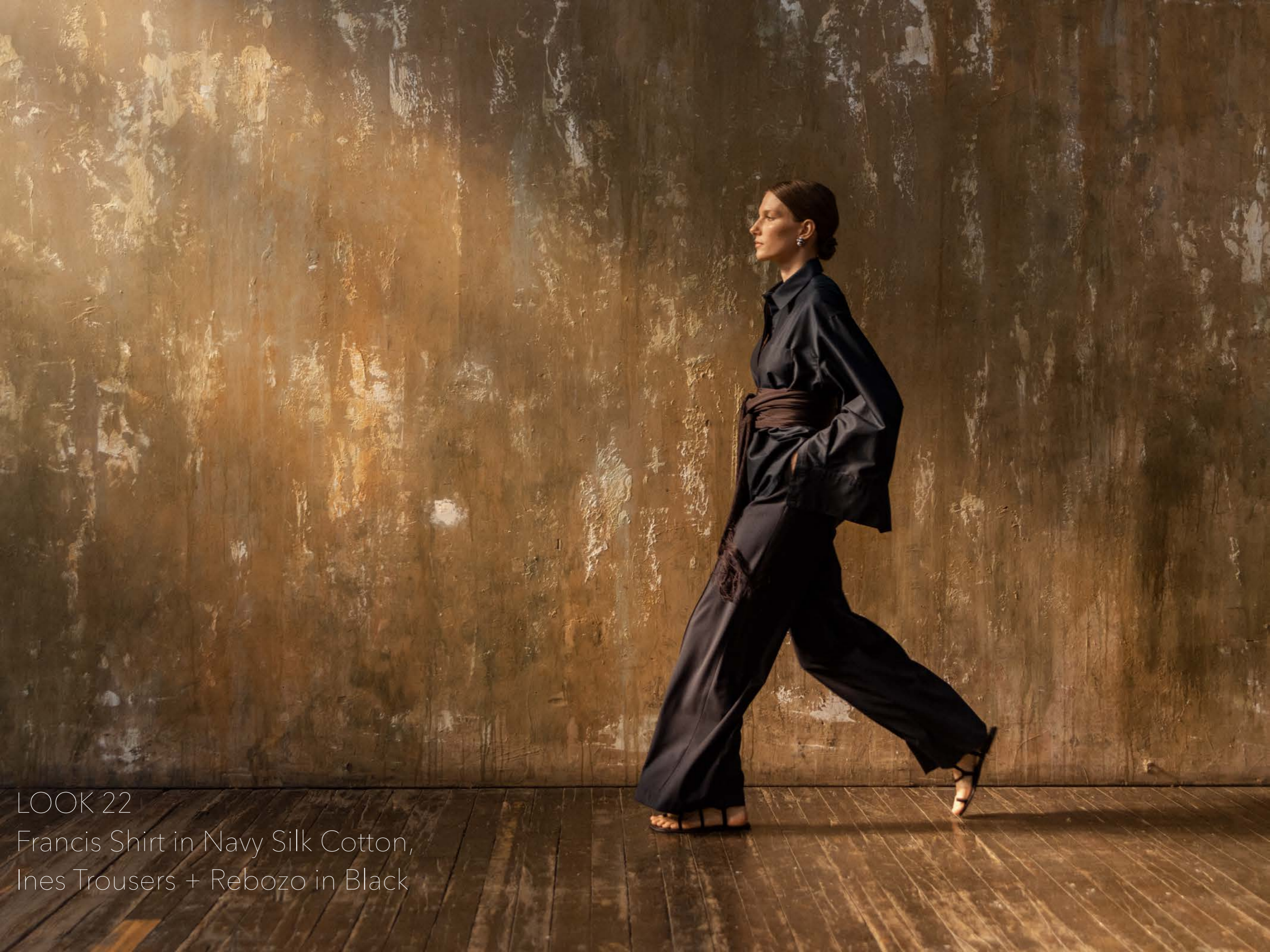
LOOK 22 Francis Shirt in Navy Silk Cotton, Ines Trousers + Rebozo in Black